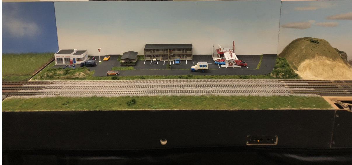
Module Layout at the Avon Lake Library Saturday, March 4 th and Sunday, March 5 th .